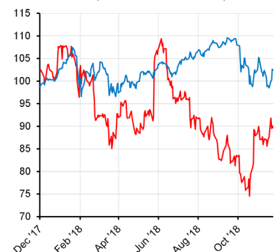
General Motors and S&P 500 Share Prices (Normalised USD Prices)

The US President also seems to be starting fights at home, as the US’s biggest carmaker General Motors announced it would be shutting 7 of its factories worldwide and slashing thousands of jobs in an attempt to save $6bn. The carmaker cited preparing for the effects of an economic downturn and trade wars as the reasons for doing so and its share price rose 5 per cent off the back of the announcement. With four of the plants set to close in the US, the move goes against Trump’s desire to rejuvenate the manufacturing industry and after the news broke, the President voiced his opposition to the closures and threatened to remove all subsidies to the carmaker.